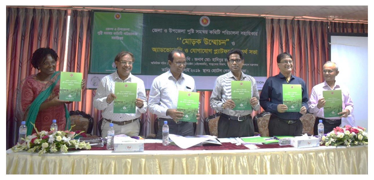
Launching of 'Operational Guideline for District and Sub-district Nutrition Coordination Committee'

Following National Nutrition Policy 2015, Bangladesh Government has been developed 'Second National Plan of Action for Nutrition (2016-2025)'- NPAN2. A Terms of Reference (ToR) for subnational level nutrition committees (district and sub-district) has already been developed and circulated last year. To standardize the operation of these committees, Bangladesh National Nutrition Council-BNNC developed an Operational Guideline for sub-national level committees