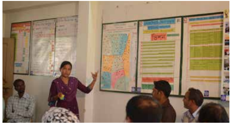
Review of five year planning in UP evaluation meeting in Kashiramelpukur UP

The outcome of the mapping exercises is then evaluated in the UP evaluation exercise conducted every 6 months (also facilitated by JATRA). Throughout the annual planning and budgeting cycle, UP members and chairmen recall the disparities which were identified in the mapping, and use the evidence from the mapping to negotiate for resource allocation; Citizen Forum members also use this data (which remains visible posted in the UP complex) to influence decision making processes related to resource allocation.