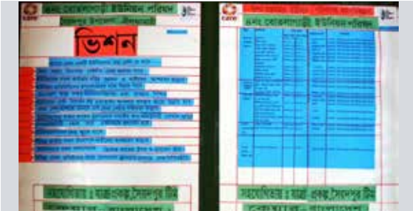
Vision and five years plan of Bothlagari UP

In JATRA, findings and analysis of the exercise were used by Union Parishads to develop five year plans, as stipulated in the Union Parishad Act 2009. This planning is mandatory for obtaining block grants from the Local Government Support Program II of the Local Government Division. The analysis provides relevant information for the Union Parishad to articulate its vision of development for a five year plan, focusing on providing equitable resources and services for poor and vulnerable communities that have been overlooked in the past.