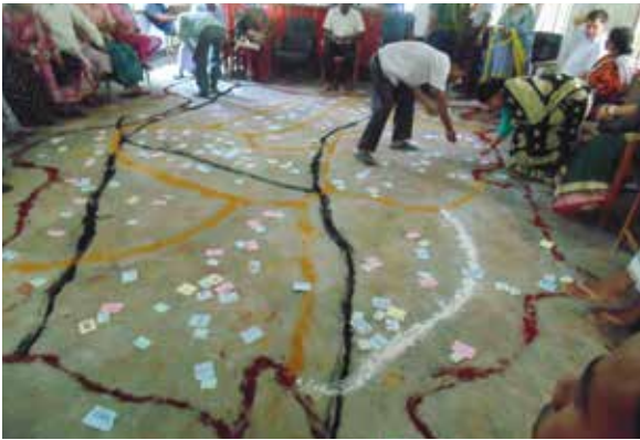
Participatory poverty and power mapping in Khatamodhupur UP

The exercise reveals a picture of sanitation coverage, and the availability of services related to education, health, agriculture and livestock by ward. It also provides a scenario of infrastructurally poor areas and issues of privilege, disparity and exclusion.