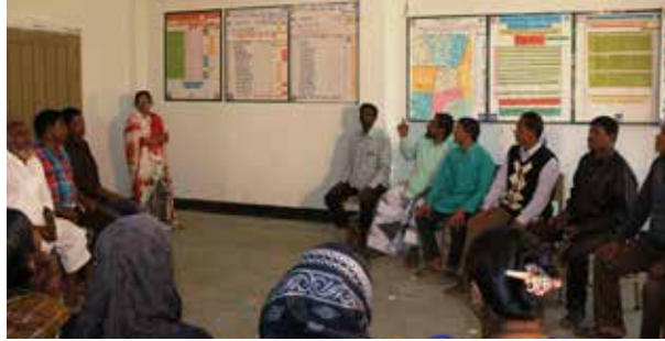
Evaluation session of performance review in Kashirambelpukur UF

In the second year of JATRA, CARE introduced an adaptation to the participatory UP evaluation process. Given that UP members have a significant responsibility to manage block grants from the Local Government Support Program (LGSP II), evaluation criteria from LGSP II was included in the participatory UP evaluation. These evaluation critieria are: planning and budgeting; fiduciary aspects (expenditure, financial management, procurement and reporting); own source revenue mobilization; transparency and accountability; and democratic governance.