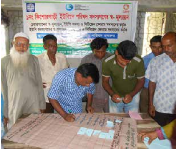
Citizen forum members marking score to UP members in evaluation session in Kishoregari UP

The participatory UP evaluation is conducted every six months during the monthly coordination meeting of UPs. Firstly, each elected representative gives themselves a mark out of 10 for a series of indicators, after reflecting on his or her own performance over the last six months. In each union, the evaluation indicators were determined in a participatory process with consultation with the union's Citizen Forum and UP representatives. The indicators focus on the attitude and behavior of UP members, especially with poor citizens; their timely attendance of public events; UP members being responsive to public queries; fulfilment of commitments given to citizens; and progress on issues identified in their union's participatory poverty analysis (also facilitated by JATRA).