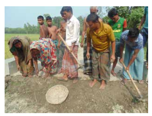
Earth filling after inter-phase meeting

In the interface meeting at the end of the Social Audit process, in the presence of 200 people, the UP chairman committed to complete the earth filling work viaanother UP program, a cash for work program. Consequently, 15 people worked for 2 days and made the road usable for 4 villages. The chairman stated in a subsequent interface meeting that if people worked with him like that in the future, any work in his constituency will be perfect.