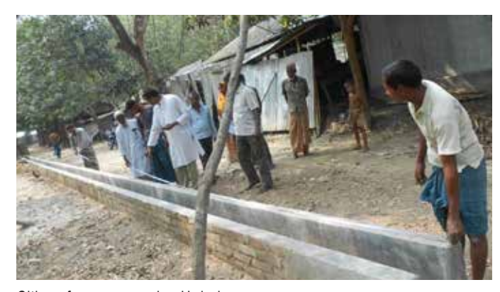
Citizen forum measuring U-drain

In February 2015, the Citizen's Forum identified the U-drain for a Social Audit. The local people had expressed grievances related to the work. The Social Audit was conducted, and determined primarily that the drain could not reduce the water logging, that the drain did not cover the whole watershed, and that the length of the U-drain was shorter than planned.