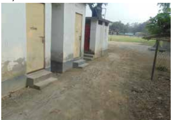
The school latrine in usable condition after social audit

Now, the 250 households of Bashudebpur have been relieved from water logging during rainy season, and children are able to use latrines that have been derelict for years.