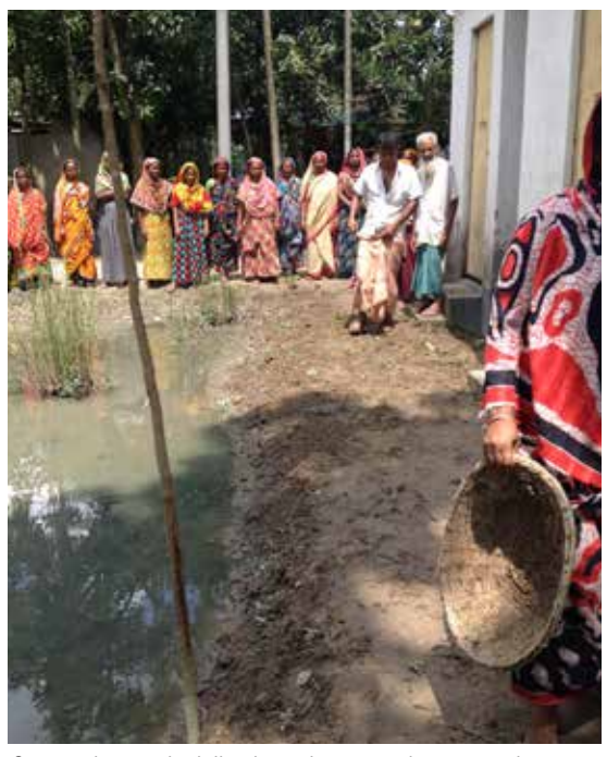
Community people delivering voluteer service to complete unbudgeted earth work

In May 2015, a second allotment of 87,000 BDT was approved from LGSP-II, to expand the length of the U-drain to 95 ft. This time the citizens and the Citizen Forum members kept the work under close observation, looked after the materials used, and constantly checked into the design of the work and the measurements of the U-drain. The second funding ensured proper draining of the water, but still could not ensure that the school latrine became usable for the children, due to its low position as compared with road. As there was no further funding for this work, the Citizen's Forum and Union Parishad has mobilized