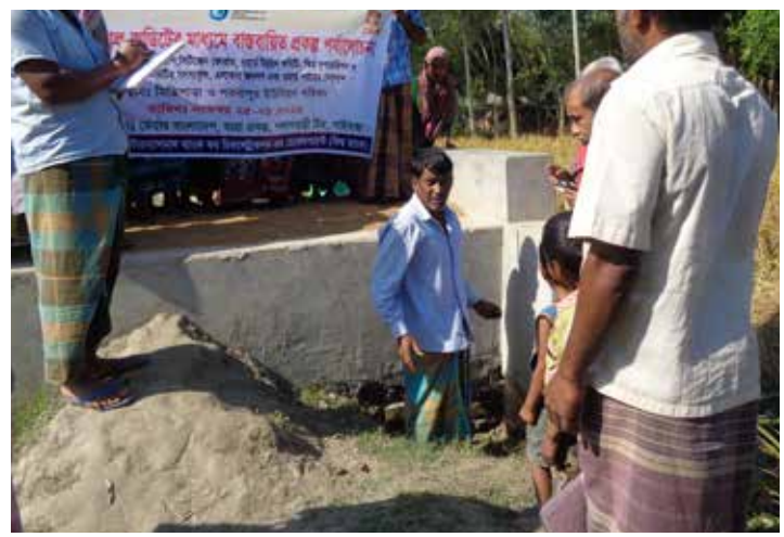
The box culvert before social audit

The villagers of Mistry para have long demanded to have a culvert installed at a particular place in the road to their village, as the water passage across the road disrupts their access to markets, schools and even to hospital. In fact, the emergency patients usually had to cross the water by being lifted onto the shoulders of others. The same constraints were also experienced by three other adjacent villages of Ward 1 of Pabnapur Union Parishad, with a total population of 800.