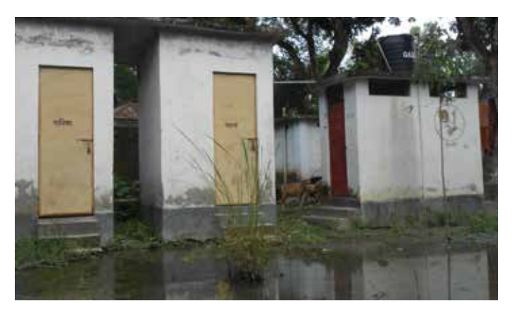
The School Latrine in inundation before social audit

The U-drain was the demand of the Bashudebpur community, to drain out rain water from the link road to the school. During rainy season, the road, adjacent ground, and the surrounding of the school toilet remained under water. It was difficult for adjacent communities to walk and drive on the road, and school children could not use the toilet. The school toilet was a previous large investment from the local division of the public health department, which had cost 270,000 BDT.