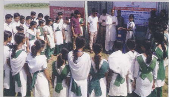
Picture 7: Implementation of the “Nutrition at the Center” project at Derai and Biswambarpur

CARE Bangladesh has been implementing the “Nutrition at the Center” project at Derai and Biswambarpur sub districts of Sunamganj district in Sylhet division. In collaboration with the Ministry of Health and Family Welfare (MoH&FW) and support from the Agriculture and the Local Government, Nutrition at the Center (N@C) project is working for improving essential nutritional services to mother and child. The Project is piloting an Uz level Nutrition Coordinating through a platform called Upazila Nutrition Coordination Committee (UNCC) with the combination of different GO sectors/department, NGO and local government.